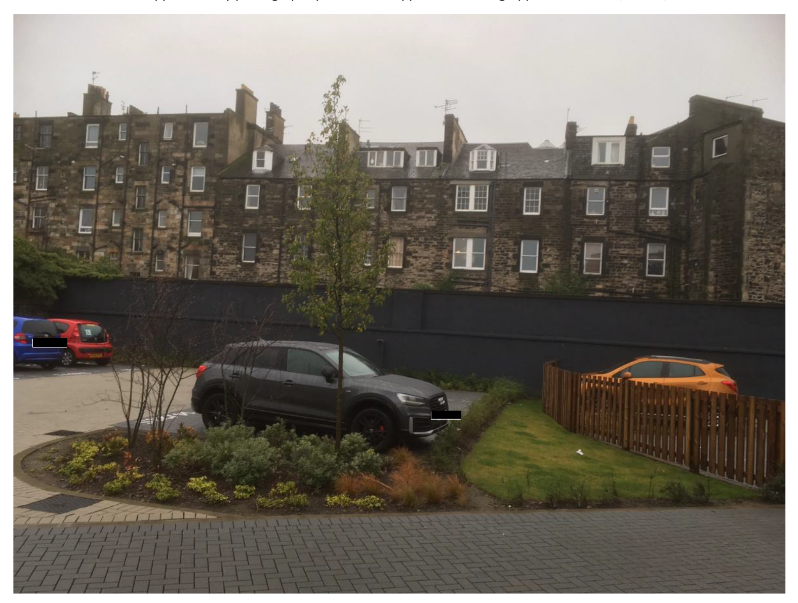
1of2. Supplementary photographs provided in support of Planning Application ref. 19/04487/FUL

Existing shrubbed area planted in accordance with the PPP approved scheme to be extended to surround newly proposed parking spaces. Planting species, including new tree planting to be fully coordinated by the landscape designer. Temporary timber fencing to be removed, and existing turfed area to be taken out in lieu of additional shrubs.